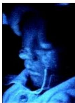
Autofluorescence of NSC-631570 at the melanoma area under UV-light during the first intravenous injection. May 2004.